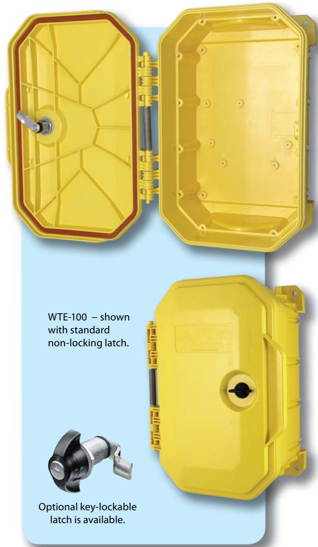
WTE-100 – shown with standard non-locking latch.