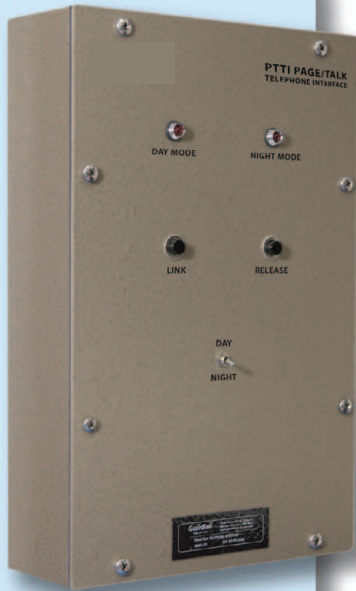
PTTI — Wall Mount