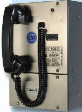
PTI Five Line Station with ambient noise level sensor and headset receptacle option