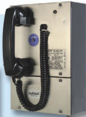
PTI Single Line Station with ambient noise level sensor