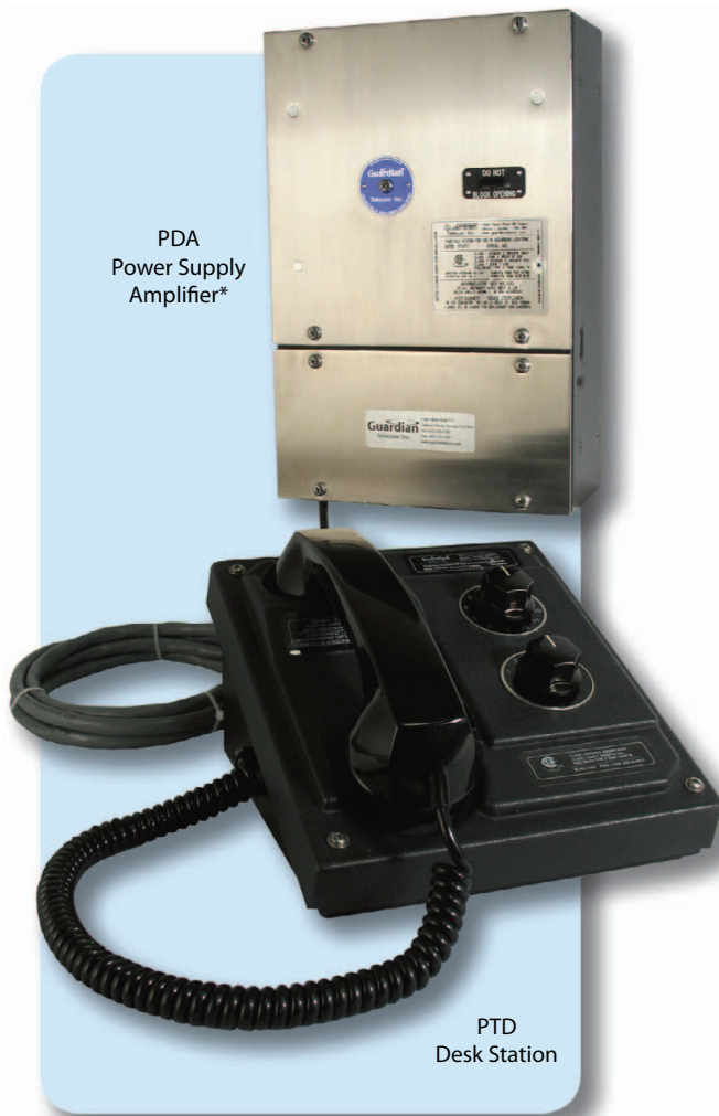
PDA Power Supply Amplifier*