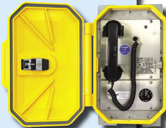
PTO Five Line Outdoor Station*