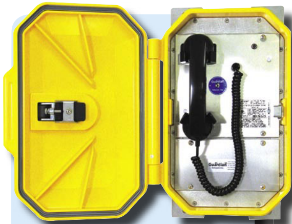
PTO Single Line Outdoor Station*