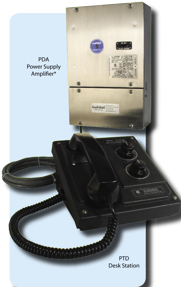
PDA Power Supply Amplifier*